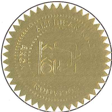
Registered Seal American Kiko Goat Association