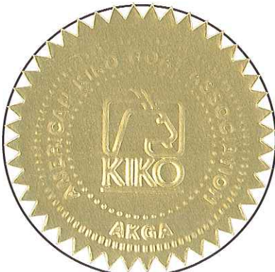
Registered Seal American Kiko Goat Association